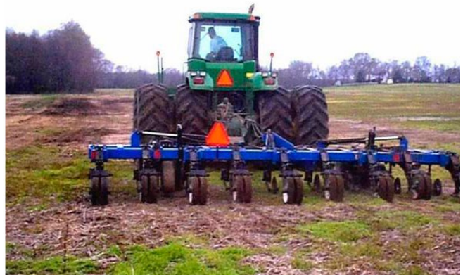
Figure 2. Deep tillage using a no-till ripper. Note the minor soil disturbance and large amount of residue remaining on the soil surface.

by animals when estimating the residue cover required to prevent erosion.