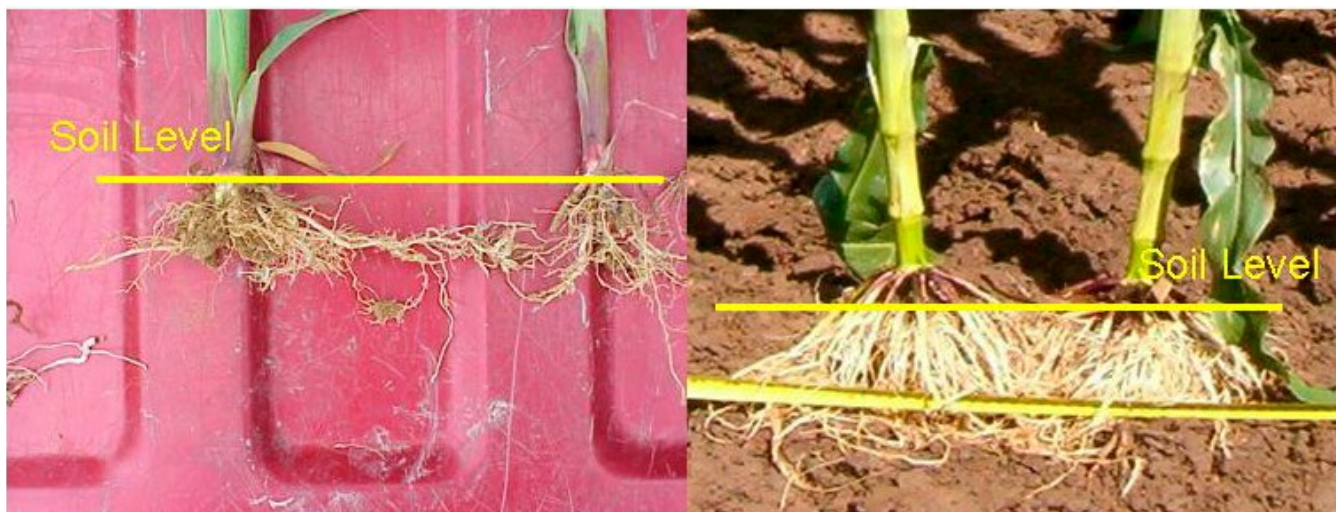
Figure 1. Corn root growth limited by soil compaction (left) and healthy roots from noncompacted soils (right).

located there. In a typical soil, air and water make up about 50 percent of the total soil volume while soil particles make up the other 50 percent. However, this can change dramatically as soil particles are pressed together and the air is squeezed out. Generally, the largest spaces are eliminated first, taking away the path of least resistance for air and water movement as well as for root penetration. Soils with a mixture of textures (some sand, silt, and clay) are more susceptible to compaction than those with homogenous texture, when exposed to the same compactive force.