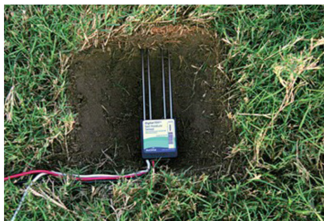
Properly calibrated soil moisture sensors predict the moisture requirements of lawn and landscape plants and are excellent additions to irrigation systems.