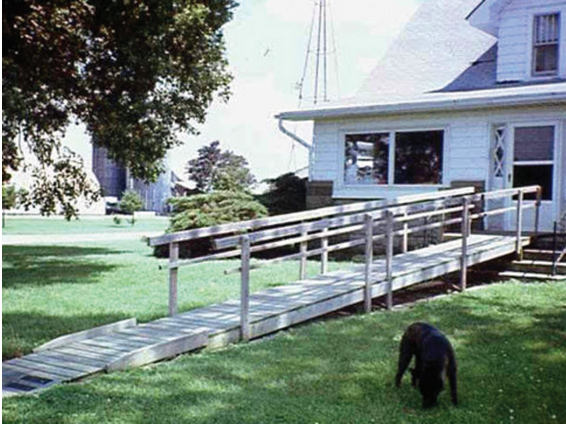
Figure 7. Ramp for improving wheelchair access.

Living space is often modified using appropriate ATs to protect farmers with disabilities from secondary injuries. These modifications may include adding ramps (figure 7) for wheelchair access, improving lighting in areas frequented by individuals with disabilities, and replacing doorknobs with lever handles for a better grip.